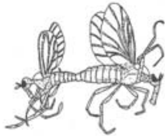
Lovebugs ( Plecia nearctica )

Female lovebugs lay from 100 to 350 eggs which are deposited beneath decaying vegetation. Larvae (immature stage) feed on decaying plant material and live on the soil surface