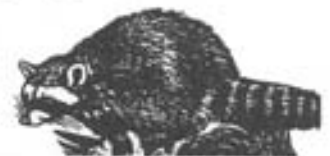
Raccoon Procyon lotor

The young clamber about the den mouth at seven or eight weeks and are weaned by late summer. At first, the mother carries them about by the napes of their necks, but soon leads them on cautious foraging expeditions, boosting them up trees if threatened but attacking if cornered. Some young disperse in autumn. Others may remain longer, but are driven away by the female before she bears her next litter, as den space is limited. Raccoons can live up to 13 years.