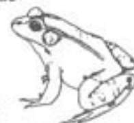
Bronze Frog Rana clamitans clamitans

There are well over 1,600 species of invertebrate and vertebrate animals in the Mobile Bay estuary, along with hundreds of plant species. In terms of biodiversity, it is one of the richest habitats in the world.