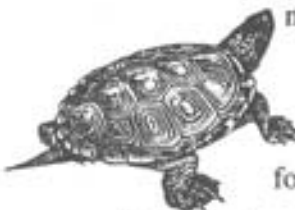
Mississippi Diamondback Terrapin Malaclemys terrapin pileata

In the afternoon, the piercing eyes of a Bald Eagle watch a school of gizzard shad as an Osprey plunges into the water and flies off with a red drum. Striped mullet panic and jump as crevalle jacks attack. Long-jawed, ferocious Atlantic needlefish prowl the surface looking for tidewater silversides as spooked halfbeaks leap from the water. Bay whiffs, hogchokers, speckled worm eels, rangia clams and stout razor clams bury in sandbars. Little Blue Herons and Glossy Ibises search for crawfish and insects in the marsh. Largemouth bass wait for bluegills and redear sunfish in tape grass beds. Yellow bass chase golden shiners and weed shiners, as redspotted and bluespotted sunfish feed on scuds.