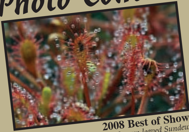
2008 Best of Show Narrow-leaved Sundew Richard Dowling - Pratoille, AL

It's that time of year again... start preparing your pictures for the 10th annual Weeks Bay Photo Contest!