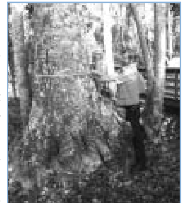
Pat Waldrop, Baldwin County Forester, conducting the official measurement of Weeks Bay's State Champion Sweetbay Magnolia.

The Alabama Forestry Commission has recently designated the second State Champion Tree at Weeks Bay Reserve. The first is a Chickasaw Plum ( Prunus angustifolia ) located on the canal in the Safe Harbor area. The second is a Sweetbay Magnolia ( Magnolia virginiana ) on the boardwalk behind the Interpretive Center. This huge tree is 10 feet in circumference, 88 feet tall, with an average crown spread of 36 feet.