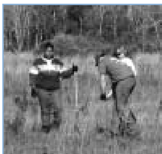
Students planting pines at Graham Creek Nature Preserve.